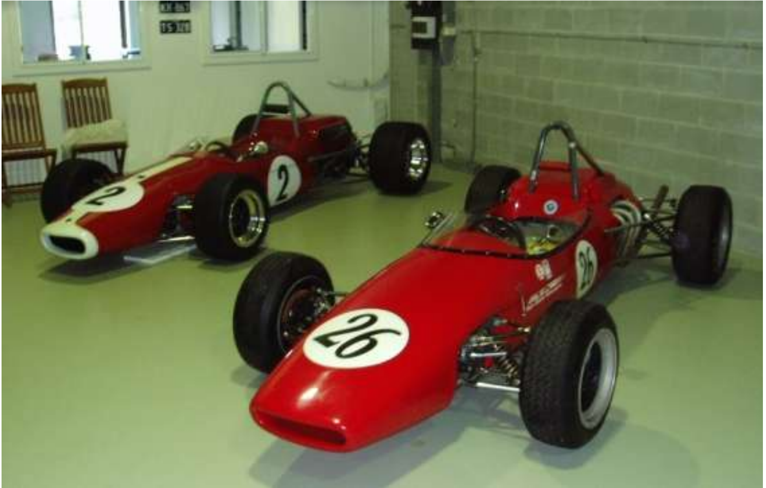
FL-8-65 sitting next to its stablemate, the Brabham BT23