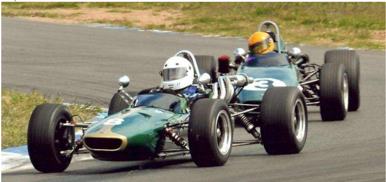
2 Elfins, Carter's Mono, Hodgson's 600 both doing 5.0's Peter Schell photo.

Once again the two very experienced single seater pilots turned on a great display of close racing, this Peter Schell photo shows them as far apart as they were over 8 laps, with Richard crossing the line just .08 seconds the better, note the heat haze off the Mono's exhaust.