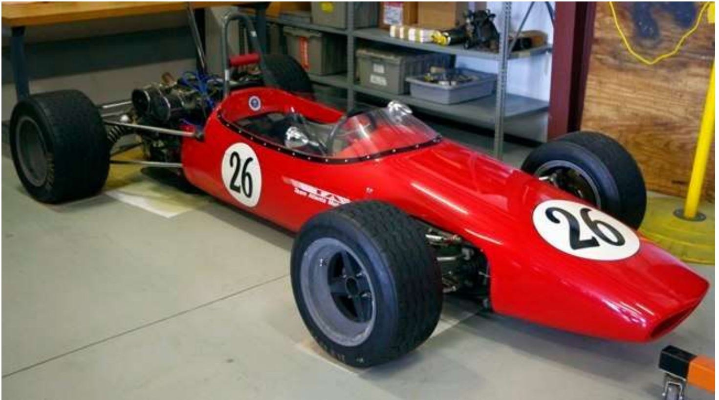
This is a photo before moving the car from where it sat for 10 years.