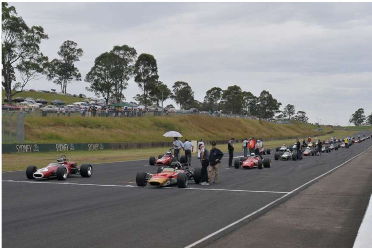
The 2012 Tasman Revival Race Eastern Creek waiting starter's orders

The third bi-annual Tasman Revival is but a distant memory and planning for number four has begun. Like most major start-up events, the Tasman Revival has taken three events to reach a point where it can take its regular slot in the calendar, both national and internationally. Also like all such events, the cost to the promoting club of running the earlier meetings has been substantial and the HSRCA is to be congratulated on its perseverance, its commitment to historic motor sport in Australia and its belief in the Tasman concept. Championships come and go and our country has played host to some sensational motor sport, but none, with possible exception of the national Grand Prix (Formula 1 since 1985) has been as influential and important to Australian motor sport and worthy of tribute as the Tasman Series.