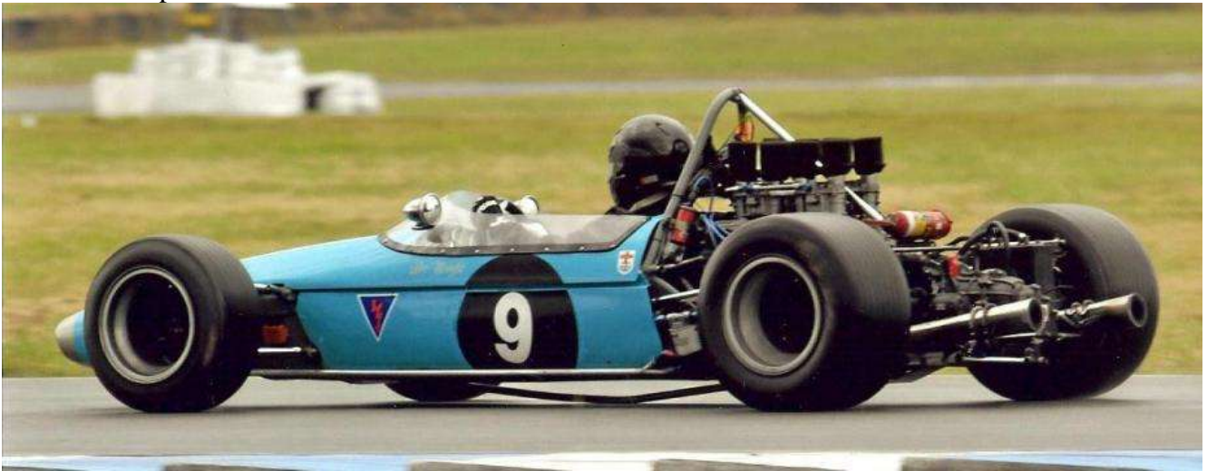
Clearly visible in this photo, the oil pipe adrift on the Brabham Buick.

It only took 2 races before the “new” green Mono landed on the top spot of the dais! Richard Carter in a masterful display of wet weather driving, managed to bring the Mono home a full 17 seconds clear of Ross Hodgson in the Elfin 600 over the 6 lap journey. Simon Pymble found the extra grip through extra weight beneficial and finally disposed of that pesky 18 which Roger himself brought home ahead of the might of the BT21 Brabham Buick. That is not to say that Les did not have his own problems, a dragging oil pipe added to the fun of the damp track.