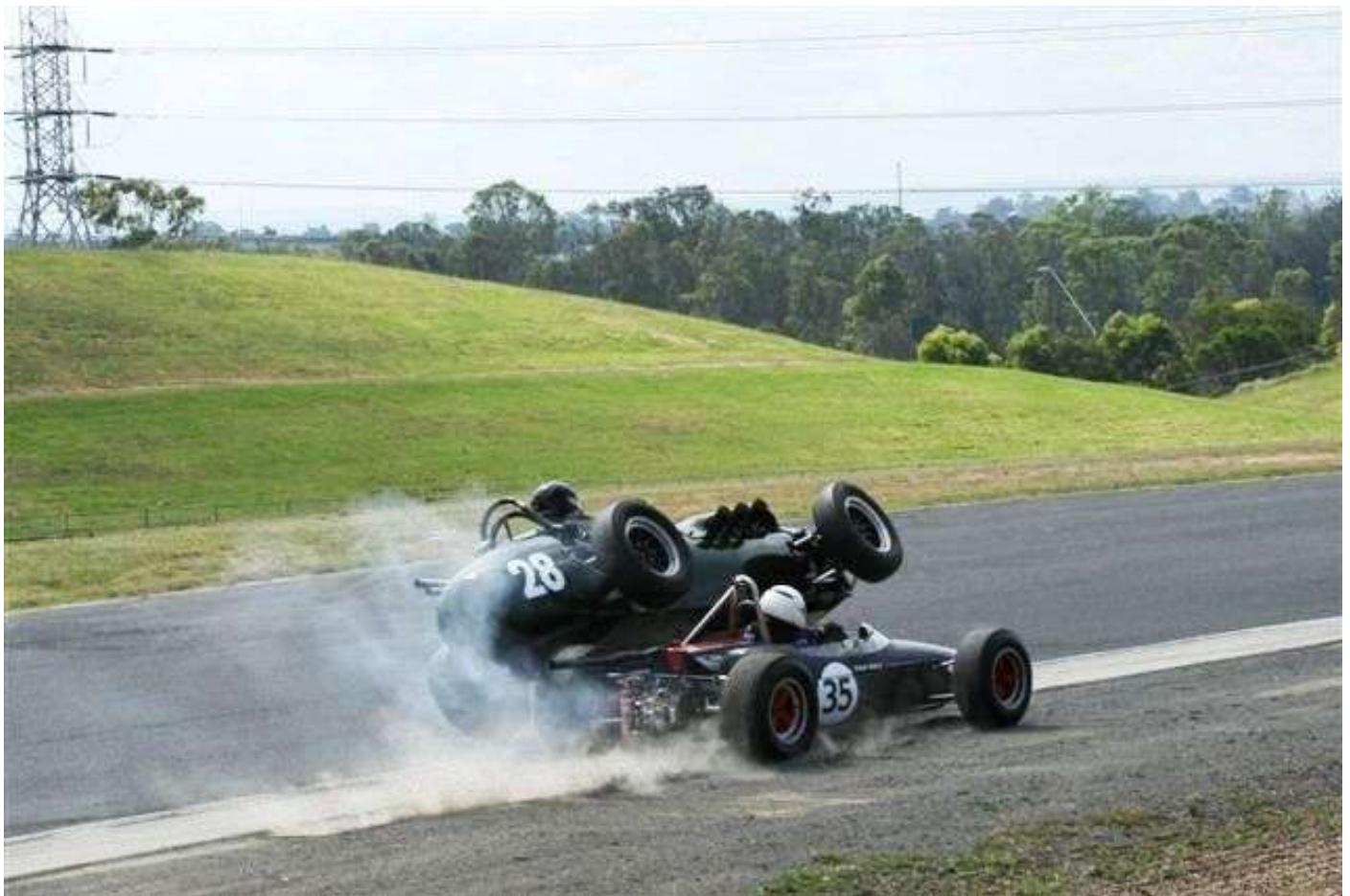
Dalro and the Brabham exit turn 2

I still have a very vivid image of the shiny aluminium undersides of the Dalro Special and also of a large spinning wheel under full neck snapping acceleration as it bumped and gyrated its way over my left shoulder before leaving a black wheelie mark from the windscreen down alongside the red stripe already painted on the nose of the car. I managed to drive to the pit entrance before turn four. Considering the severity of the impact the damage appeared to be limited to a bent left front steering arm, minor body and wheel damage and a bent tailpipe. It did look, however, like my meeting was over. Needless to say I was not best pleased by this prospect.