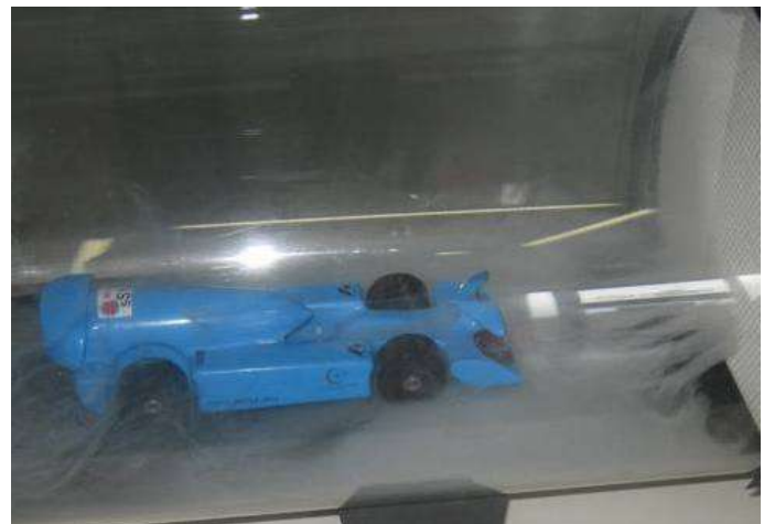
The winning Pentaglider Team from Launceston near Longford Tasmania just before winning the title.