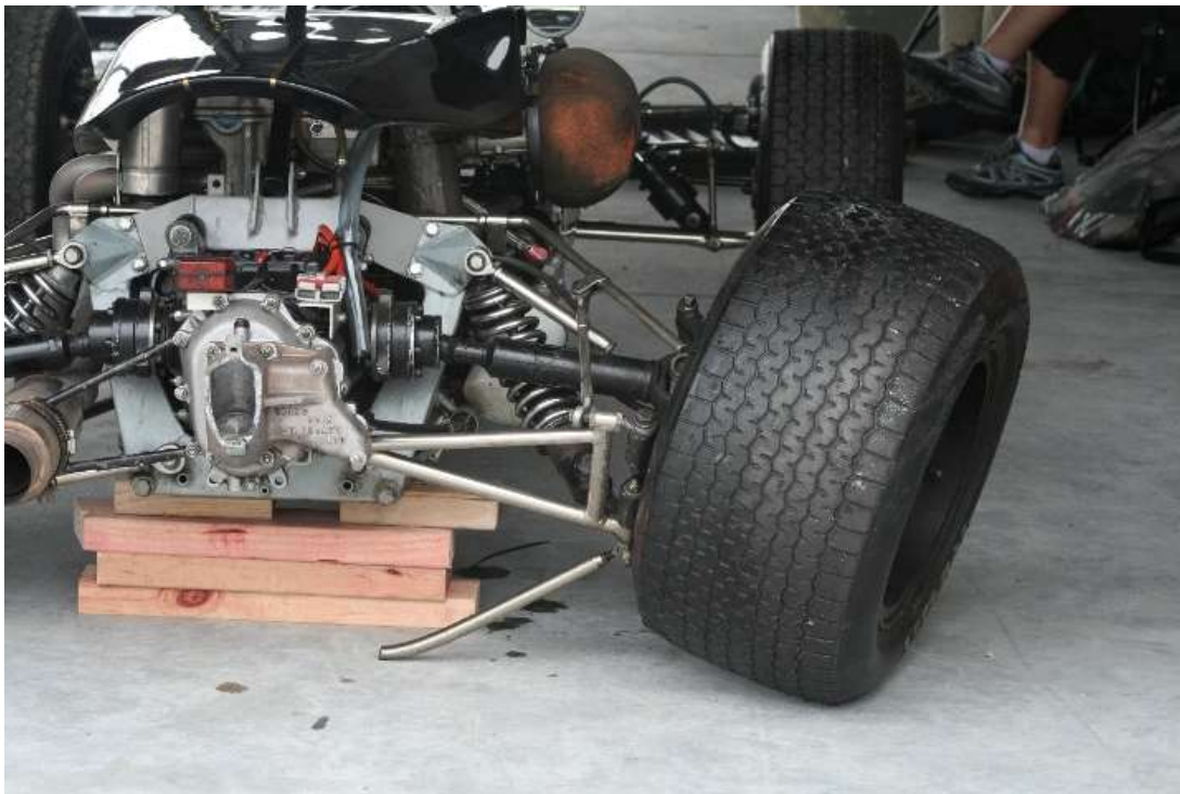
The damaged rear end of the lotus 41C