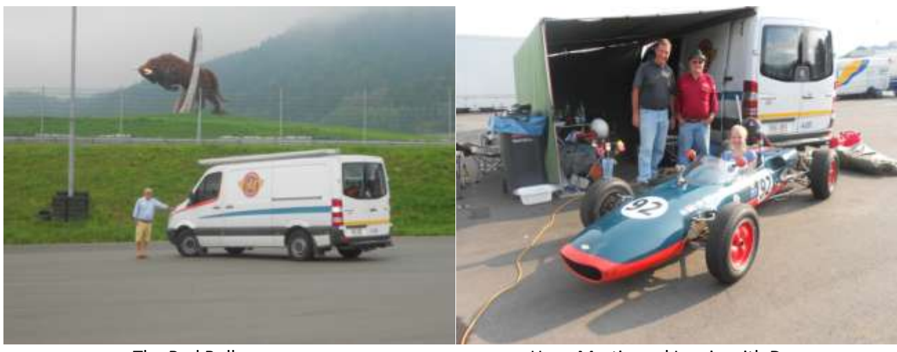
The Red Bull