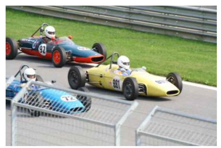
Pole Sitter 991 stopped at the start