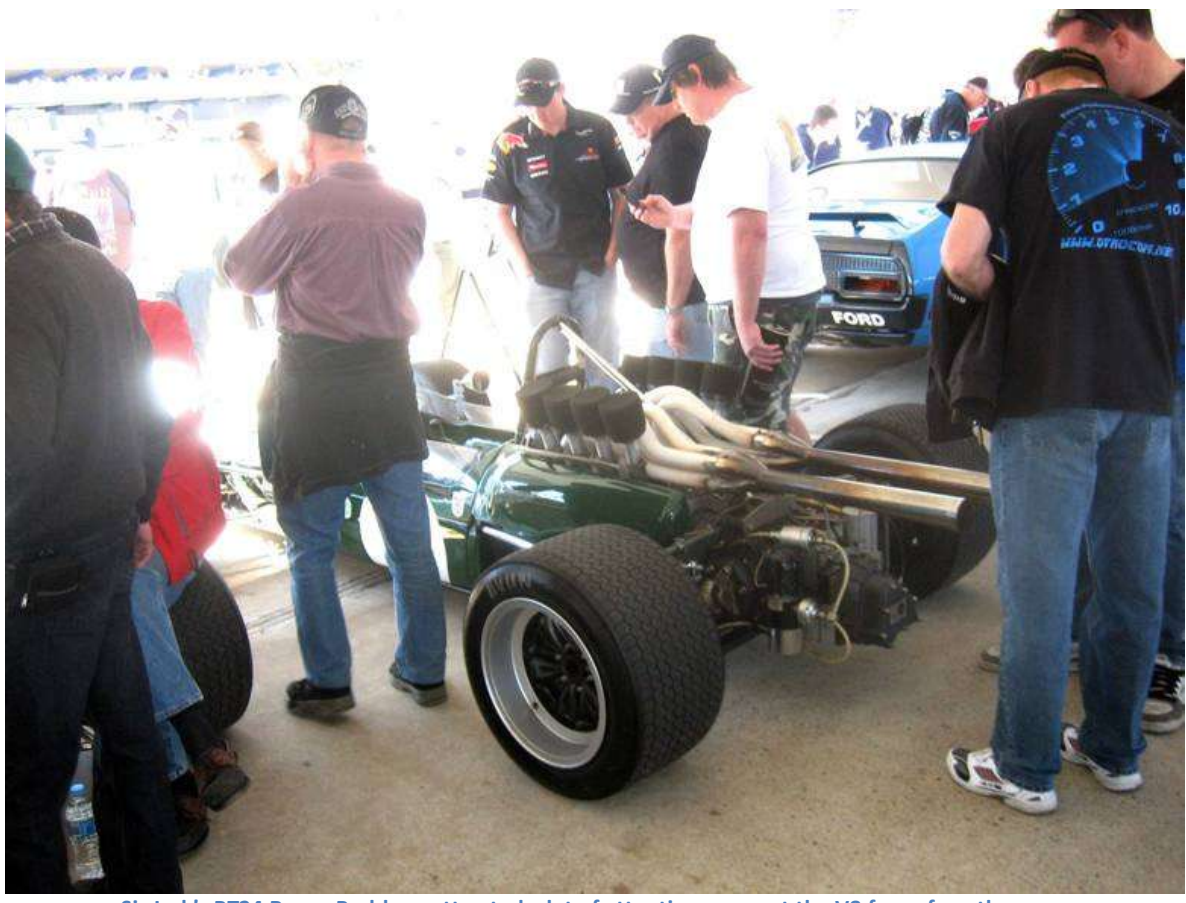
Sir Jack's BT24 Repco Brabham attracted a lot of attention amongst the V8 fans of another era.