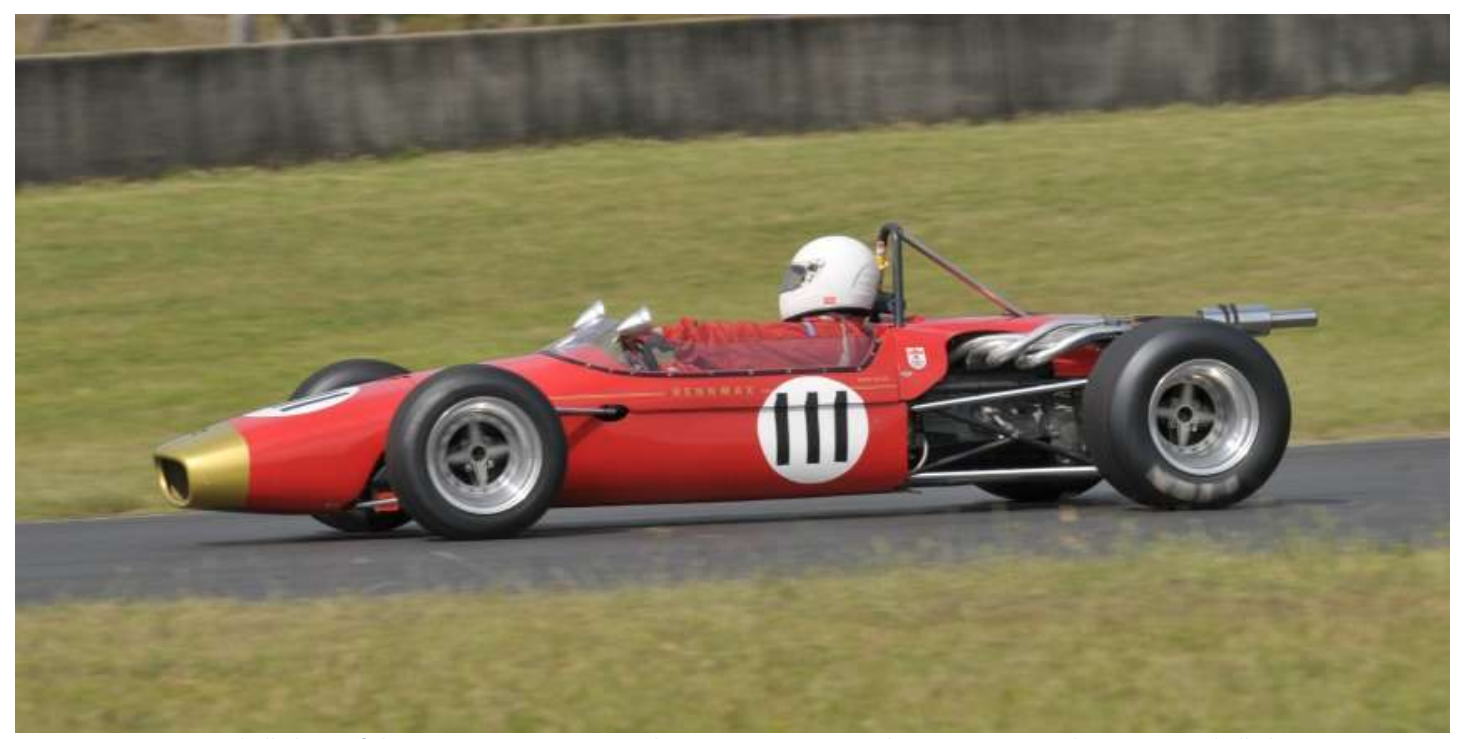
A Peter Schell photo of the Rennmax competing in the 2008 Tasman Revival race Eastern Creek.