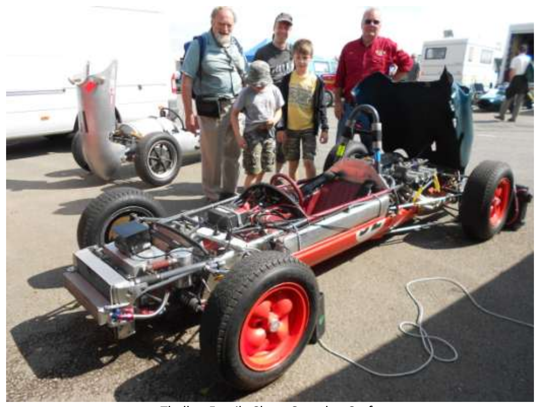
Thallon Family Cheer Squad at Croft