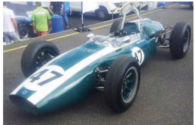
Ex Bruce McLaren Cooper Climax at Sandown