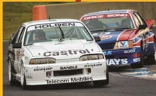
Heritage Touring Cars 1973-1992