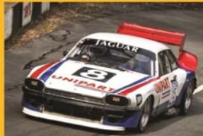
Sports Sedans 1963-1986

plus HISTORIC SPORTS CARS & FORMULA CARS