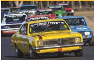
Historic Touring Cars 1953-1972

Huge TOURING CAR TRIPLE TREAT! 15'tin top' races!