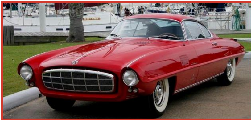
1953 Cadillac Ghia Coupe