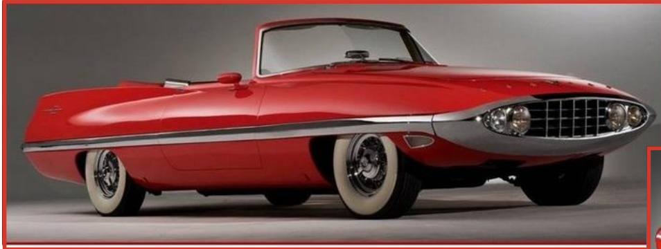
1957 Chrysler Diabolo (Diabolical's more like it!)