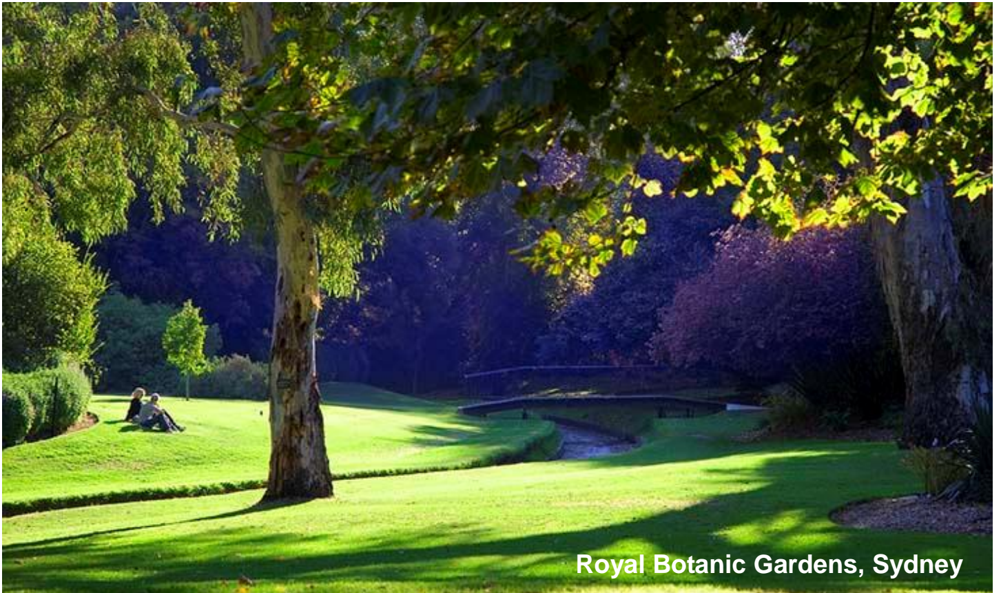
Royal Botanic Gardens, Sydney