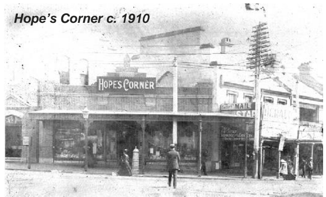
Hope's Corner c. 1910