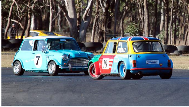
Ian Gillam (7) looking Neal O'Reilly in the eye... cold tyres, cold track, cold morning!