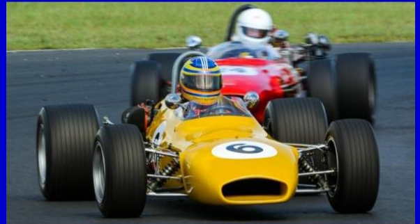
Racing and Regularity for all CAMS (5 th Category) Historic Groups