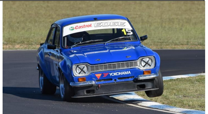
Royce Gregson Ford Escort, Improved Production (Invited with Gp U)