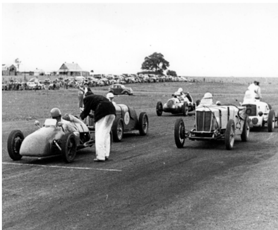
Above: On the Mt Druitt, NSW start line, 27 July 1952.