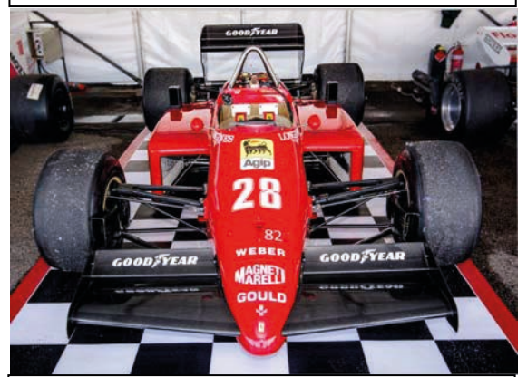
One of the many ex-F1 cars on display and racing at Sydney Retro Speedfest