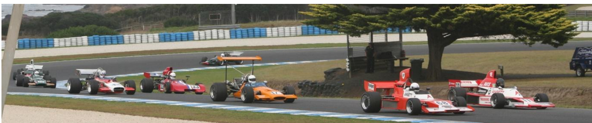
F5000: variety of models covering the era.