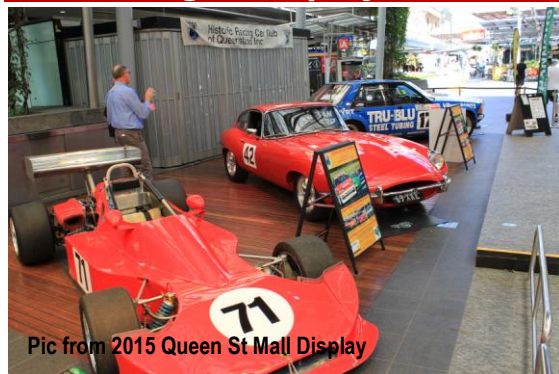
Pic from 2015 Queen St Mall Display

In conjunction with our major sponsor Shannons, HRCC was again on display to the public in Queen St Mall on Thursday 14 th April.