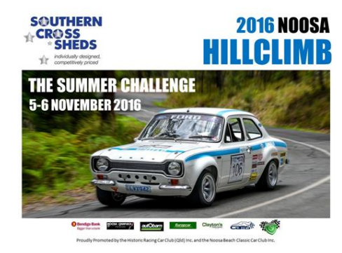
For full results Click here http://www.hrcc.org.au/events2016.htm

or go to hrcc.org.au and select 'events'