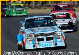
John McCormack Trophy for Sports Sedans