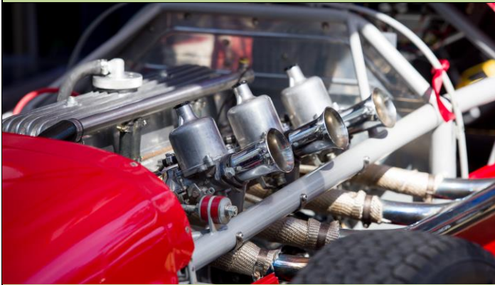
Splendid restoration of the 1958 Read Holden Special