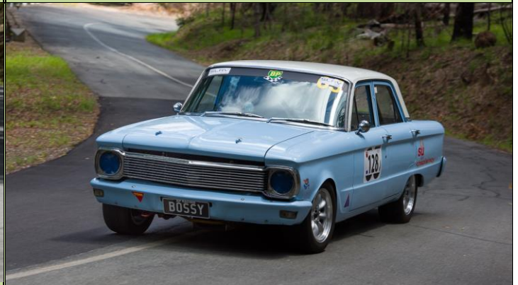
Simon Boss-Walker's nimble 1965 XP Falcon