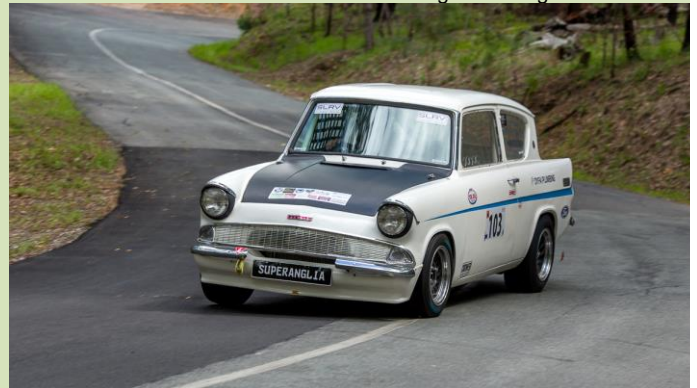
Bevan Reed, 1961 Anglia