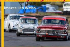
Historic Touring Cars Group Na, Nb, Nc 1953-1972

BRILLIANT AUTUMN WEATHER, COUNTRY HOSPITALITY REAL HISTORIC RACE CARS AND EXCITING RACING