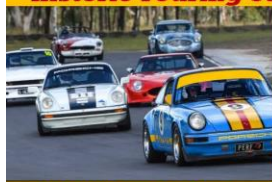
Historic Sports Cars Group S & T pre-1981