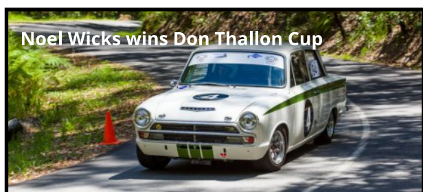
Noel Wicks wins Don Thallon Cup