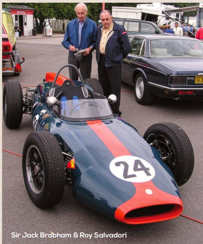
Sir Jack Brabham & Roy Salvadori