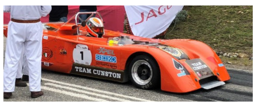
Franco Scribante six times winner of the event